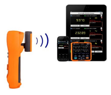
Figure 4. U1240C Series is compatible with Keysight Remote Link solution to safely measure, view, and log test measurements.