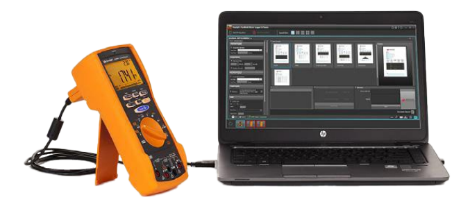
Figure 3. Easily capture test readings with the Keysight Handheld Meter Logger software.

Keep the production lines running smoothly with the U1240 Series DMMs' data logging capabilities. Users have two options to record individual readings. The first option is to simply record data into the main DMM unit by utilizing the built-in internal memory of up to 2,000 readings storage. The second option is to transmit data to a PC with the IR-USB cable utilizing the Keysight Handheld Meter Logger software or to do so wirelessly with the optional Keysight Remote Link solution. With this capability, you can ensure every reading gets recorded accurately at intervals you specify. Better yet, you can eliminate the conventional data entering process and generate error-free automated test reports in various forms such as a graph, table, and statistical information or limit test results.