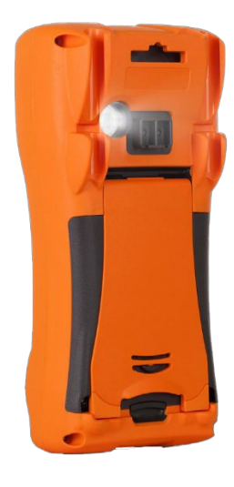
Figure 2. Ergonomically shaped with a built-in flashlight.

Designed for handheld users working in poorly lit environments, the U1240C Series fits comfortably in your palm, allowing you to single-handedly illuminate the test area with its easily activated built-in LED flashlight. With ergonomics in mind, you can swiftly make more measurements without straining your hands even over a longer period of time.