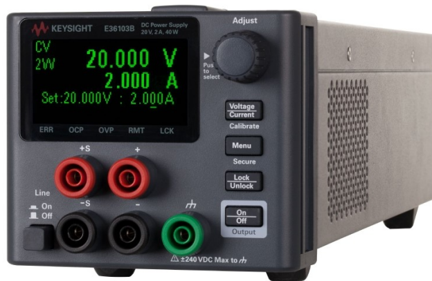
Option J01 recessed binding posts

Do you need to convert the power supply for different mains power? The two switches on the bottom of the instrument make it straightforward. See the product manual for details.