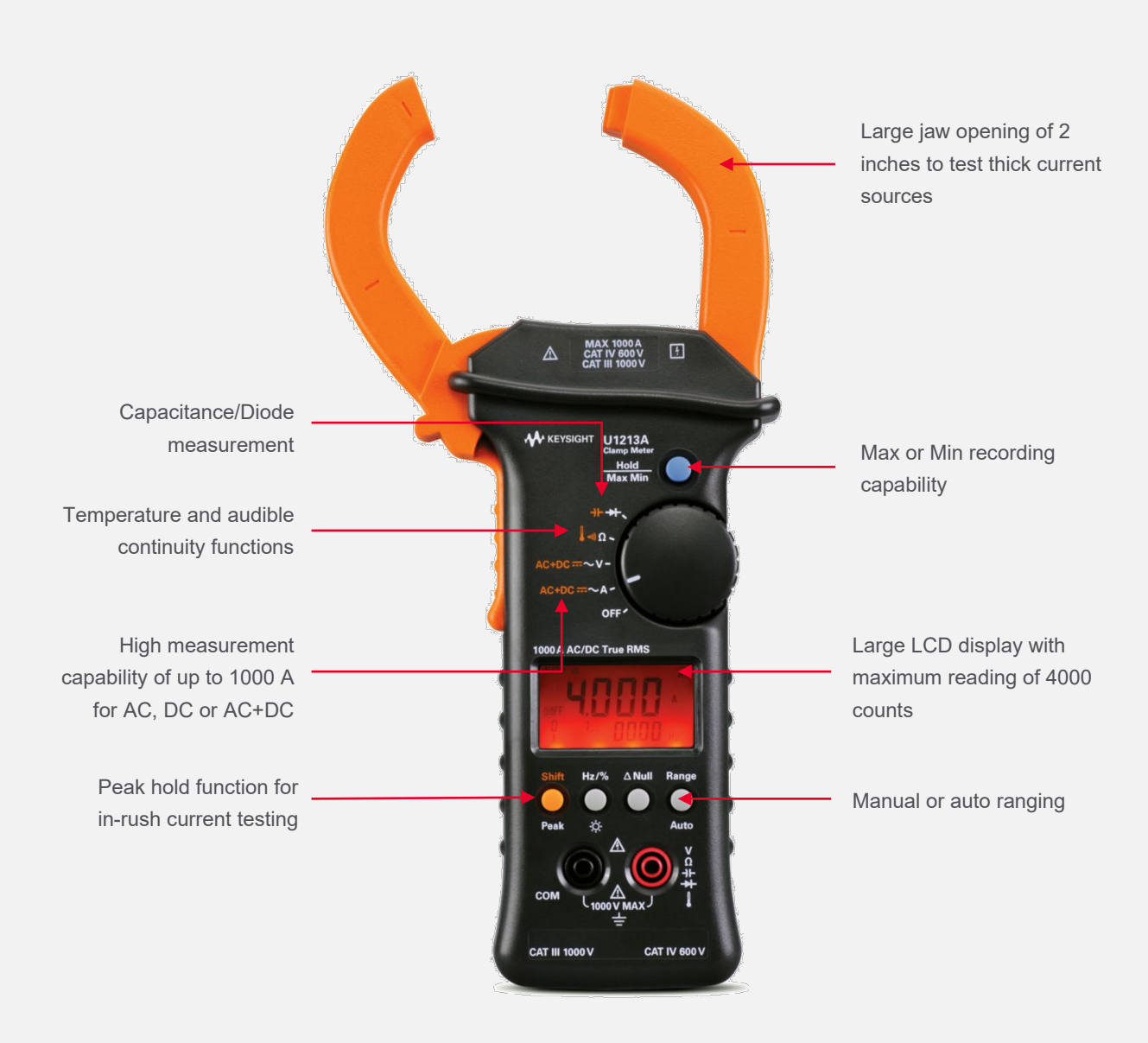
Figure 5. Front view of U1213A handheld clamp meter