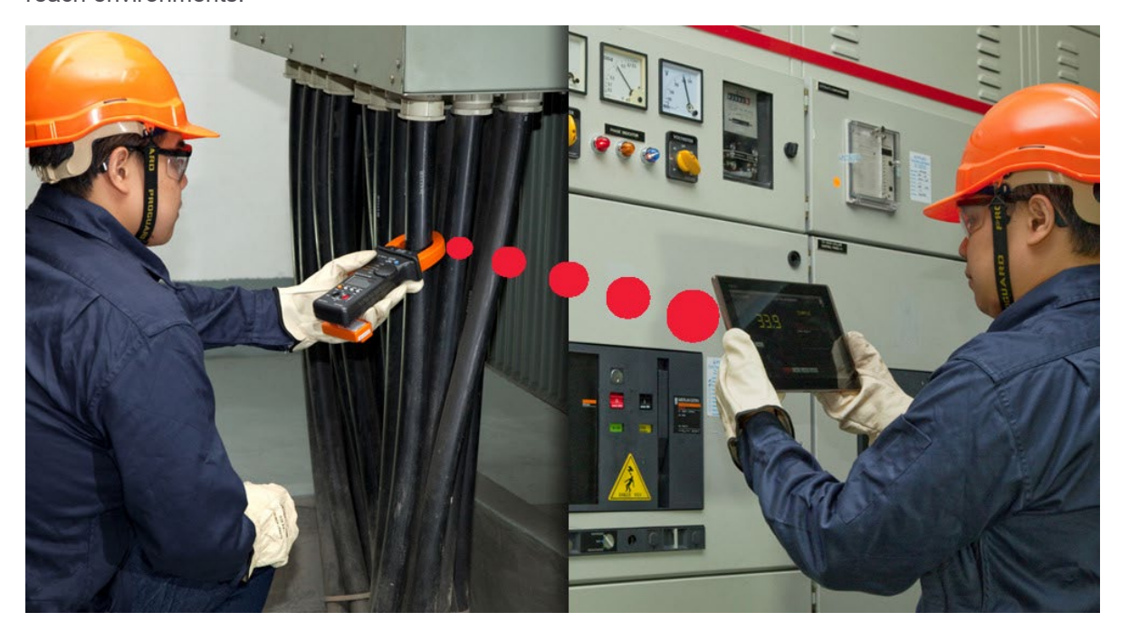
Figure 4. Monitor measurements and log data up to 10-meters range across all Android platform devices with the U1177A Infrared-to- Bluetooth adapter.

By adding the new Bluetooth capability to your existing U1210 series handheld clamp meters, you can make high current measurements more safely and conveniently. With the U1177A Infrared-to- Bluetooth adapter, you can easily monitor and log data up to a 10-meter range across all Android platform devices, providing an added benefit for maximum efficiency and productivity in a variety of difficult-to-reach environments.