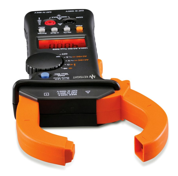
Figure 1. U1210 Series handheld clamp meter

Ensure that the clamp meter measures only one conductor at a time. Measuring multiple conductors may cause inaccuracy in measurement reading due to vector sum of the currents flowing in the conductors.